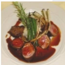
Pan-Seared Rack of New Zealand Lamb with horseradish, smashed red bliss potatoes, haricot verts and a rosemary jus