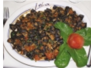
Black Squid Ink Farfalle with spicy red crabmeat sauce

Address: 402 New York Avenue, Huntington 631-271-8341