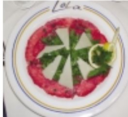
Thin-sliced beef, served cold, with Parmigiano and arugula