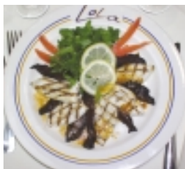
Grilled Portobello Mushrooms with grilled calamari, arugula, oil and lemon