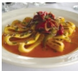
Grilled Calamari served with Piri Piri sauce