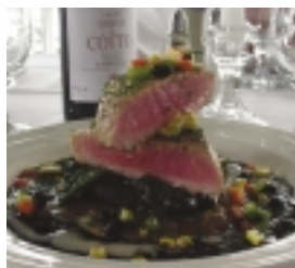
Grilled Tuna served atop a roasted Portobello mushroom and caramelized onions, with a Merlot reduction and vegetable relish

Recently, I enjoyed an afternoon lunch of eye-popping presentations.