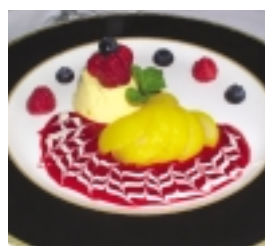
Mango mousse with poached pear and raspberry couli