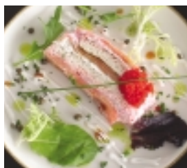
Smoked Salmon Terrine, layered with smoked salmon, caviar, salmon sour cream and blinis